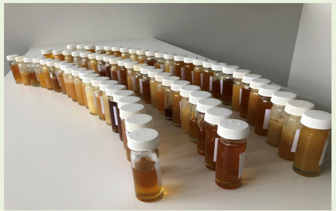
Analysis will include the 7 CODEX tests:

Moisture content Fructose, Glucose, Maltose and Sucrose Water insoluble solids Electrical conductivity Diastase activity Hydroxymethylfurfural (HMF) content pH