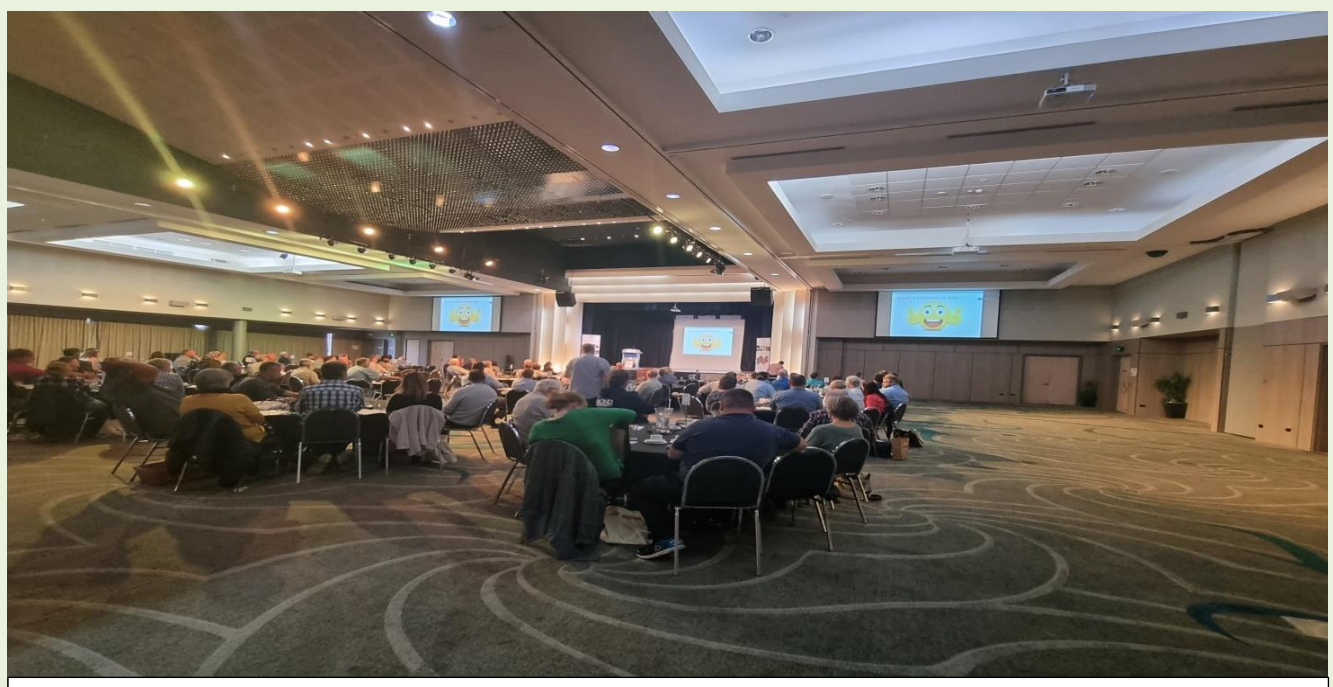
B-QUAL video presentation Queensland Beekeepers Association conference Gold Coast June 3<sup>rd</sup> 2021